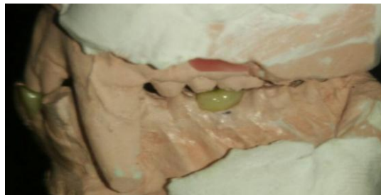
Figure 1. Working model with provisional restoration mounted on an articulator

The implant stability is examined using Ostell ISQ (Fig. 3) on the same day as implant placement after 1 and 2 months. Teeth 46, 36, and 38 are examined. Before the dental implant stability is examined using Ostell ISQ, magnets are placed on the buccal and lingual side of the provisional restoration as a transducer, and a probe is directed toward the magnet in a buccolingual direction at 2–3 mm distance. When the probe is at the right distance, the instrument will generate a short beep. A longer beep indicates that the examination has been completed, and the ISQ value can be seen on the display screen of the instrument.]