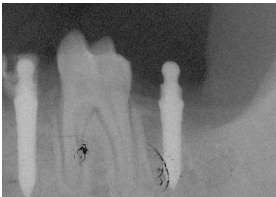
Figure 2. Implants placed teeth 36 and 38