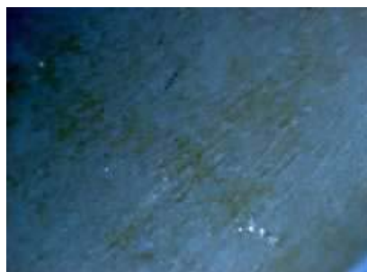
Figure 3. Enamel surface of 3 rd group (negative topical solution control) with 100 times magnification using light microscope