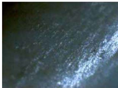
Figure 1. Enamel surface of 1 st group (baseline) with 100 times magnification using light microscope

There were differences in the microscopic pictures of the rats' enamel surface between groups. The extent of the destruction on the enamel surface was shown by enamel surface roughness. Enamel surface roughness was based on the number of black shadows in the pictures, with rough surfaces having more shadows because the light source was located on the side.