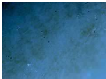
Figure 5. Enamel surface of 5 th group (topical Solution containing S. insularis ) with 100 times magnification using light microscope