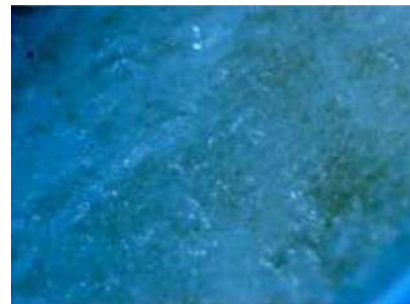
Figure 2. Enamel surface of 2 nd group (negative food control) with 100 times magnification using light microscope