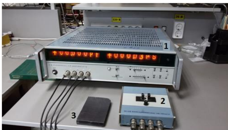
Figure 2. Digital L, C, R meter type E7-12 and magnet for the experiment: 1–E7-12, 2–adapter, 3- magnet.

Measuring cell with fine-dispersed magnetic particles is installed in the adapter slots (2). In order to create a magnetic field used permanent magnet (3) (Figure 2). To determine force of magnetic field (magnetic induction) of the magnet which acts on the measuring cell, microteslameter MT-10 is used.