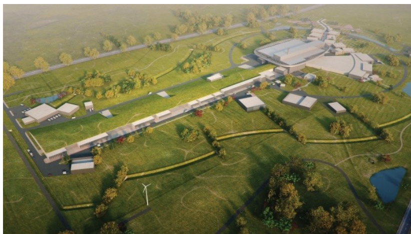
Figure 1. Artist's impression of the ESS after completion.

The European Spallation Source [1] (see figure 1) will be a high brightness source of spallation neutrons for materials and other studies. It is currently under construction in Lund, Sweden and is scheduled to produce its first neutrons in 2019. It is planned to build the facility in two stages, with the first accelerating protons to 1.3 GeV and 3 MW beam power. The second stage will extend this to 2 GeV and 5 MW. It will then deliver a peak neutron flux seven times more powerful than any existing accelerator based spallation source and a peak flux 30 times greater than any reactor based neutron source.