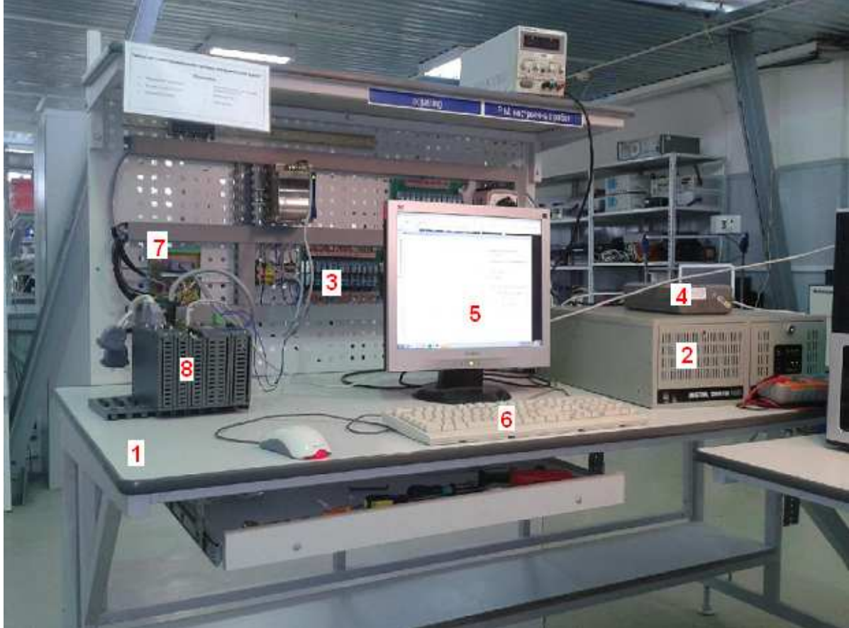
Figure 2. The test bed of the ELSY-TMK controller: 1 - a table of the tester, 2 - an industrial computer, 3 – a system of signal switching, 4 – a unit for specifying the external voltage (SA100calibrator), 5 – a monitor, 6 – a keyboard, 7 – a special demountable connector of the switching system, 8 – an ELSY-TMK controller with extension modules as an object-to-be-tested.

For automation purposes, the connection and control of an industrial computer were established with the object-to-be-tested and the calibrator on the test bed (Fig. 2).