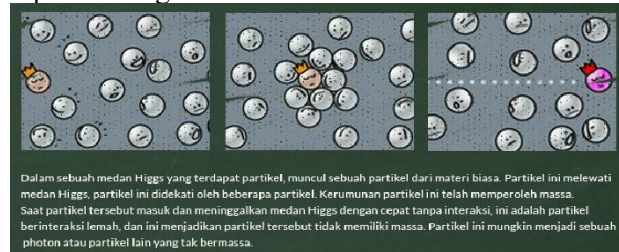
Figure 1. particle interaction to the Higgs field [12]

Higgs boson mass fill and interact with the Higgs field, the massless particles can interact strongly with the Higgs field, which are then observed as a mass. Particles that do not interact with the Higgs field are massless and will pitch kale granted.