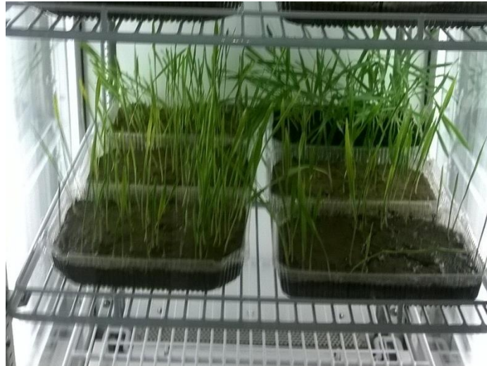
Figure 1. Sprouting barley seeds in climate chamber (Panasonic MLS).

For biotesting, soil samples ( m = 500 g) are placed in special containers and moistened to 60% of the total field capacity. In the prepared soils, barley seeds (not less than 40-50) are planted. Containers are placed into a climate chamber (Panasonic MLS) with automatically controlled parameters: temperature (day time - 21^\circ\text{C} , night - 16^\circ\text{C} ) and illumination (day - 16 hr, night - 8 hr). Exposure period is 14 days (Figure 1).