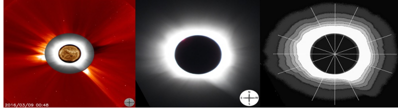
Figure 1. Left panel: TSE image is superimposed on the relevant X-ray image from SDO/AIA193 (inner) and streamer structure from SOHO/LASCO to confirm the exact rotation. Middle panel: Example of the white-light corona during 2016 TSE from our observation with f/5.6 aperture and 1/60s exposure. Right panel: isophotes images with marking line for measurement of flattening index .

The north-south direction of the four TSE 2016 observation images were rotated by 66^\circ clockwise (figure 1: Left panel) to get the proper orientation and matched with reference images (see Section 2)