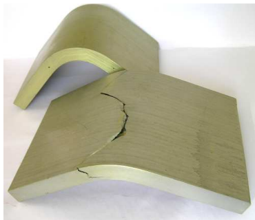
Figure 1. Bending plates of aluminum alloy ABT-102 with a thickness of 24 mm at the room temperature (in the foreground) and the hardening temperature of 470°C (in the background).

Experimental studies in uniaxial tension for alloys based on aluminum V95ochT1 (very pure alloy V95 treated in mode T1) were carried out for the purpose of definition of rational modes of loading. The experiments were performed on testing machine Zwick/Roell Z100. The diameter of tested round specimens is 8 mm, working length L has value from 36 to 41 mm. Specimens were cut from the plate of thick 15 mm. The rate of the traverse displacement (one of the specimen end) has constant value during the experiment. The logarithmic strain is determined based on the traverse displacement. Since the strains obtained by measurements of the traverse displacement in the linear elastic stage have overestimated values, the strains are corrected based on measurements of the additional strain sensor in the elastic stage. The stresses are determined in view of the incompressibility. Since the cross-sectional area of the sample changes in the process of loading, the strain rate isn't constant value at a constant rate of the traverse displacement [14, 15]. For small deformations the strain rate can be assumed to be constant and equal to the rate at the initial stage of deformation with correction of the elastic component.