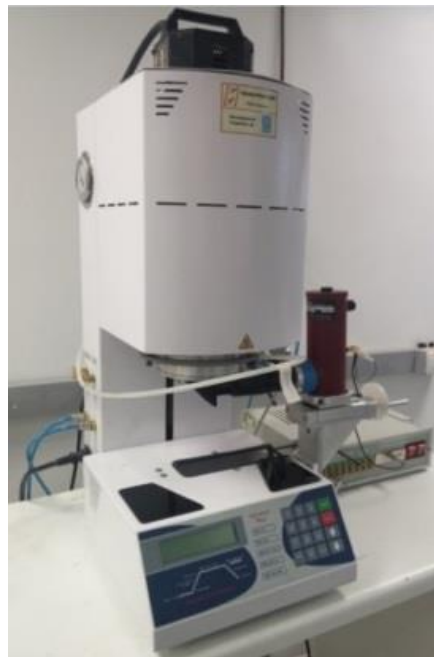
Figure 2. Diffusivimeter QuadruFlash 1200.

This diffusivimeter, manufactured in Brazil, is constituted by a xenon lamp (1200 J), responsible for the energy pulse, three K-type thermocouples of special class, an InSb infrared detector, an oven for heating the sample and a signal processing unit. A short thermal excitation is generated by the xenon lamp. The flash is directed inside a resistive furnace, allowing heating of the tested specimen from room temperature to 1200 °C and the temperature rise of the specimen is measured by three K-type thermocouples.