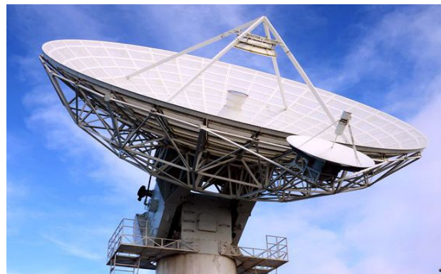
Figure 2. tracking radar on space tracking ships.

The radar tracking system aboard the Yuanwang space tracking ship is capable of providing continuous accurate spherical-coordinate information of the target in real time for mission operational decisions and for future evaluation of performance. The radar can be used as a single system, or as one of a chain of radars along a flight path to ensure continuous tracking throughout the entire flight.