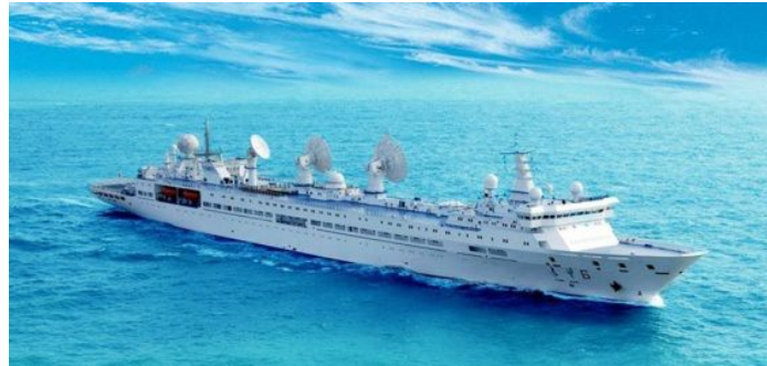
Figure 1. China's new-generation space tracking ship.