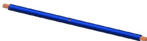
Figure 3. Example of a through defect.

The through defect minimum size is calculated (figure 3) which can be detected by means of the electrosparking control method. Obviously, there is a through defect with extremely small cross-sectional area of the conducting channel which will not be detected.