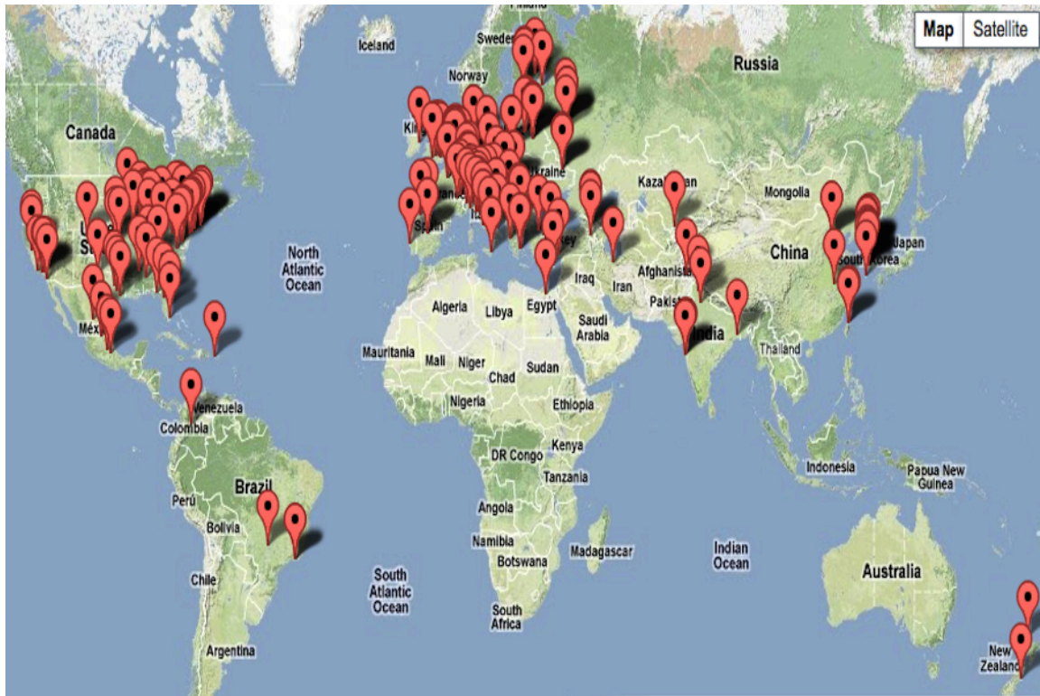
Figure 1. World map showing locations of CMS collaborating universities and institutes

The CMS data management system [5] keeps track the centrally managed file replicas in the central data transfer management database. The SpaceMon information collected at the sites allows to account additional storage space used by the users and groups, and various other volatile data areas, not tracked in the central catalogs.