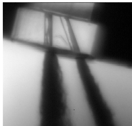
Figure 2: Representative still shot of the flow during steady state in the optically accessible nozzle when the injection pressure is at 350 bar.

This design was tested with diesel fuel supplied by a commercial reciprocating piston pump with 3 stages, driven by a large electric motor. The original injection duration was set to 250ms, but the sac volume pressure measurements indicated that the pump was not able to sustain the commanded pressure for the entire period. The resulting injection period was approximately 100ms, and the injection pressure tapered off slowly during this period.