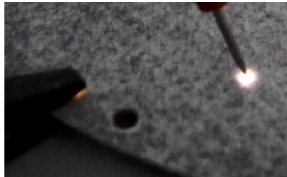
Figure 3. Zoomed in region of figure 2 with the glowing spot. The glowing spot around the earthing contact at the location of the alligator clip becomes also visible.

Since already at moderate electrical currents of 70\ \mu\text{A} to 100\ \mu\text{A} such glowing spots have been observed and former experiments [5] have shown that such currents are realistic in dust separators, the hypothesis, that the total electrical current integrated over the whole area of the filter cloth during the separation process between the powder and the filter cloth surface has been responsible for the scorch marks on the filter cloth as shown in figure 1, was strongly supported.