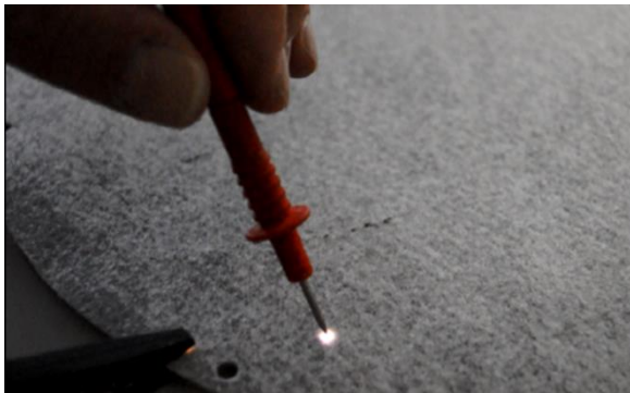
Figure 2. Glowing spot on the filter medium when contacted by the pointed electrode of a megohmmeter.