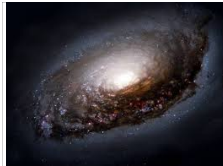
Figure 1. A view of NGC 4826. The boundary between counter-rotating and direct rotation is indicated by the dark dust lanes, approximately 3000 light years from the galaxy's center. Relative velocity of the two flows is 300 km/s.