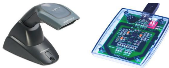
Figure 2. Two different types of reader: left one-barcode reader, and the right one is RFID-reader.

SCS reader requires to be separated from desktop computer, with Java and PostgreSQL installed in this desktop. Furthermore, connection to server's database is required to be established; however, it is not strict condition, as SCS reader module stores all data in text file.