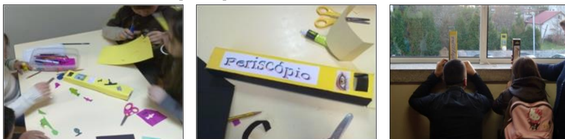
Figure 3. Periscopes built by the students.