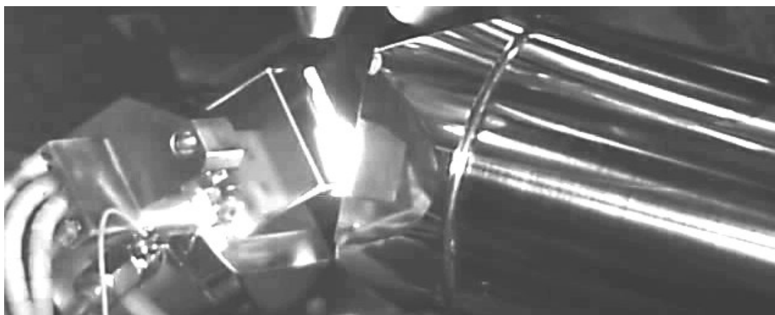
Figure 1) In-situ heater at 70° stage tilt during EBSD analysis sample heated to 750°C.