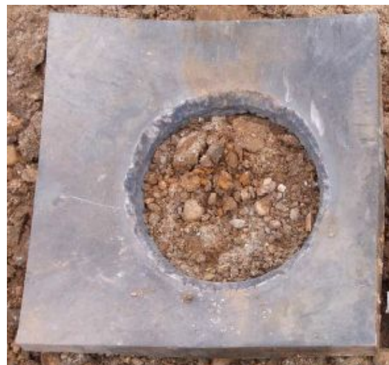
Figure 4. Witness plate from NOGO in Shot 10.