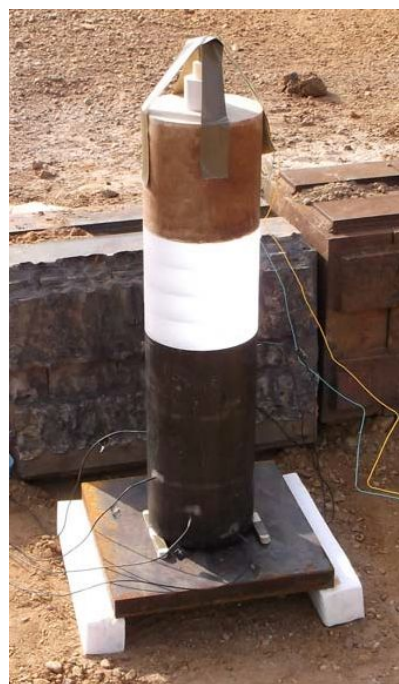
Figure 2. SLSGT setup for Shot 2.