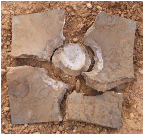
Figure 5. Witness plate from NOGO in Shot 2.