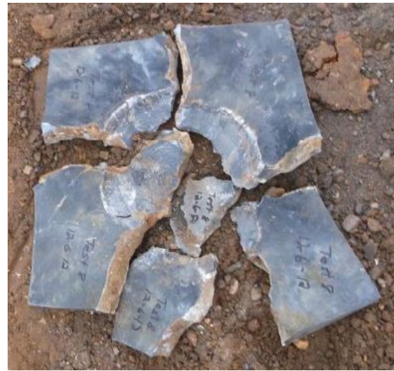
Figure 6. Witness plate from NOGO in Shot 8.

The pin data in figure 7 exhibit slower initial velocities as gap thickness increases, as was observed in ELSGTs on PBXN-109 [3]. There was HVD at 7.44 \text{ mm}/\mu\text{s} for the entire sample with no gap (Shot 1); transition to HVD about half way down the sample with a 102-mm gap (Shot 3); and transition near the end of a sample with casting voids for a 146-mm gap (Shot 12), and in a sample without casting voids for a 152-mm gap (Shot 4). The higher velocities shown in figure 7 following transitions near the witness, especially the 8.47 \text{ mm}/\mu\text{s} for the last two pins in Shot 4, are possibly a phase effect from central initiation proceeding both radially and axially. For a 149-mm gap (Shot 11) that is just beyond the critical gap for samples with casting voids, the initial velocity was 3.55 \text{ mm}/\mu\text{s} for the first half of the tube before transiting to a LVD of 5.23 \text{ mm}/\mu\text{s} that punched a clean hole in the witness plate, although at reduced diameter. The response for a 152-mm gap in Shot 10 was similar. For greater gaps there was steady LVD, decreasing from 3.52 \text{ mm}/\mu\text{s} for a 154-mm gap to 3.06 \text{ mm}/\mu\text{s} for a 203-mm gap, with small rough holes in witness plates.