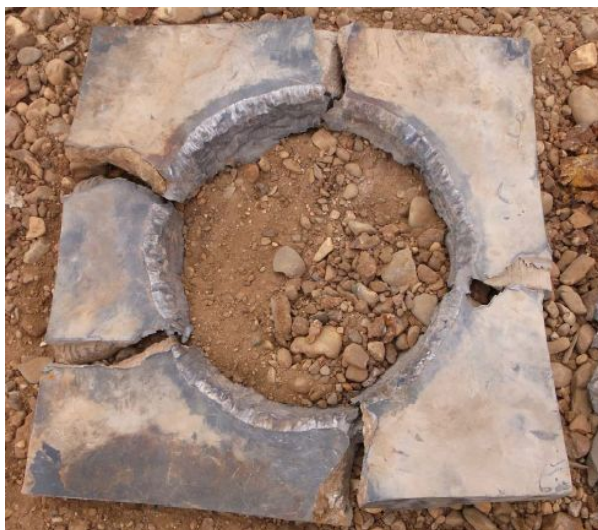
Figure 3. Witness plate from GO in Shot 1.

*NOGO witness plates: 1 = Small clean hole, 2 = Small rough hole, 3 = Partial hole