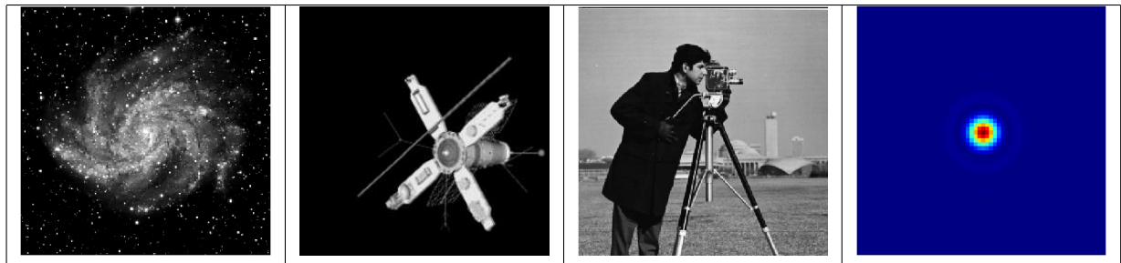
Figure 1. The original images and the original PSF

We have investigated the numerical performance of our method by testing it on various image restoration problems and we report a few examples here. As test images, we use the spiral nebula NGC 7027 ( 256 \times 256 ), the satellite ( 256 \times 256 ) and the cameraman ( 512 \times 512 ). The blurred image is generated by circular low-pass filtering, i.e. by convolution with an Airy pattern, and corrupted by Poisson noise which results in a root-mean-square error (RMSE) of 1% for the nebula and the satellite and of 2.5 % for the cameraman.