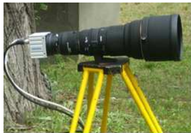
Figure 2 – Off-the-shelf digital camera with long focal length lens.

The proposed optical methodology makes use of a digital camera with a long focal length lens (identical to the one presented in Figure 2) rigidly installed in the central section of the bridge's main span and oriented towards one of the tower's foundation where a set of four active reference targets is placed, being each target composed of several near-infrared LEDs organized in a circular geometrical pattern. This approach requires the accurate knowledge of the relative coordinates between the four targets (world referential) and it is supported on the previous intrinsic parameterization of the applied camera from which its focal length, principal point coordinates and lens distortion corrections [8] are accurately estimated.