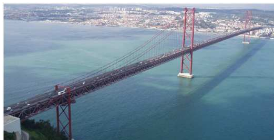
Figure 1 - The 25 th of April suspension bridge in Lisbon (Portugal).

The first approach mentioned – GNSS – is supported on the use of antennas installed near the measurement region receiving signals from available satellites, thus providing absolute three-dimensional displacement measurements without any limitation regarding to the geographical location of the bridge. Although the absence of long-term instrumental drift makes this approach attractive, its accuracy is strongly dependent on several external factors, namely, the number and distribution of the on sight satellites, the atmospheric conditions and the multi-path effect resulting from multiple signal reflections on the bridge's metallic components (see Figure 1). This last effect also compromises the use of interferometric systems, since the emitted microwave signal can be multi-reflected on the metallic stiffness girder of a suspension bridge, thus affecting its measurement accuracy.