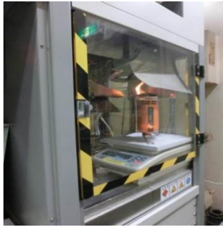
Figure 1. Setup in the cone calorimeter test.