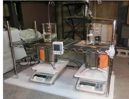
Figure 2. Setup of water heating test.