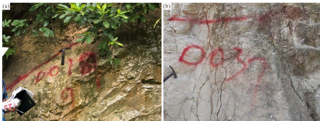
Fig.2 characteristics of ore bodies a.massive bauxite b. clastic bauxite

Fuxing bauxite is composed of dense bauxite, clastic bauxite, braided bauxite, and earthy bauxite (Fig. 2). The main ore is composed of a brittle bauxite and crumb-like bauxite (Fig. 2, b) and a transitional type between earthy ore and vermicular ore. The dense ore content is low and the grade is low. High-grade ore has black ore and light gray ore (two kinds, the rest of the ore color is between light gray and black). The Fuxing bauxite is not layered, the shape varies, mostly funnel-shaped, the specific shape is determined by the underlying depression. The thickness and grade change of the ore body are relatively large, and the stable extension range of the ore body is generally not more than 50m.