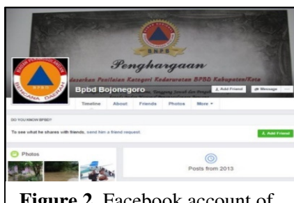
Figure 2. Facebook account of BPBD Bojonegoro

The use of social media in Bojonegoro Regency only used during the disaster and post-disaster to know the water level and the location of the disaster. The use of social media needs to be maximized so that information can be spread faster. Prior to the disaster, social media can also be used to educate the public about what they need to prepared in disaster case and provide the public with information about contacts that can be contacted during an emergency