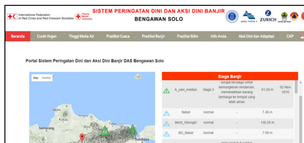
Figure 1. Website of Early Warning System and Early Action of Bengawan Solo

Based on Figure 1 it can be seen that on the website of the early warning system and early action of Bengawan Solo flood, there is a report column telling the condition in the area which contains information of status symbol, location and water level and time of the incident. In the flood alert column, there is information about the water level. The symbols divided into three namely standby 3, standby 2, and standby 1.