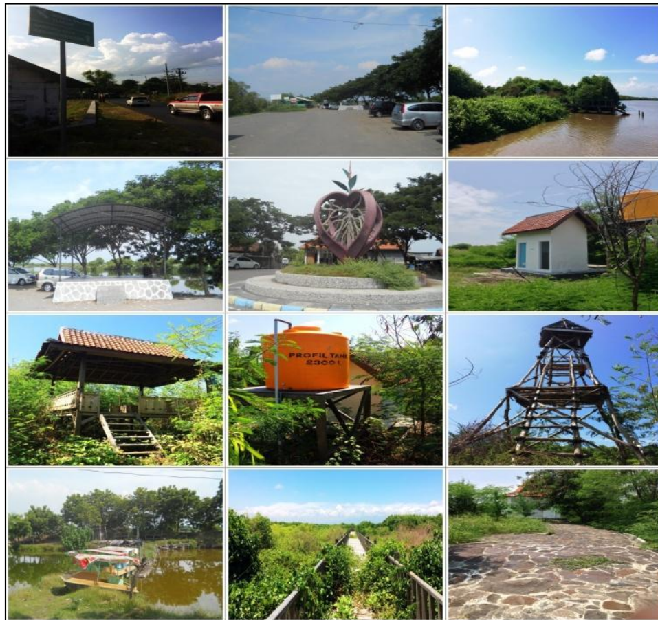
Figure 4. Facilities and infrastructure at Tlocor hamlet and Lumpur Island.

Potentially, mangrove and pond in Sidoarjo Lumpur Island which has an area of about 70.38 ha and 2.58 ha respectively, is appropriate to be an eco-tourism area. Through land use that is adapted to the surface characteristics of the area, conservation of mangrove both will remain preserved and provide economic benefits for the community continuously. The people of Sidoarjo and the City of Surabaya can make the municipality of Lumpur Island as one of its tourist destinations. The mangrove potential is not only found at Lumpur Island but also in areas in Sidoarjo regency, highly potential to make Sidoarjo regency as a model city of eco-tourism.