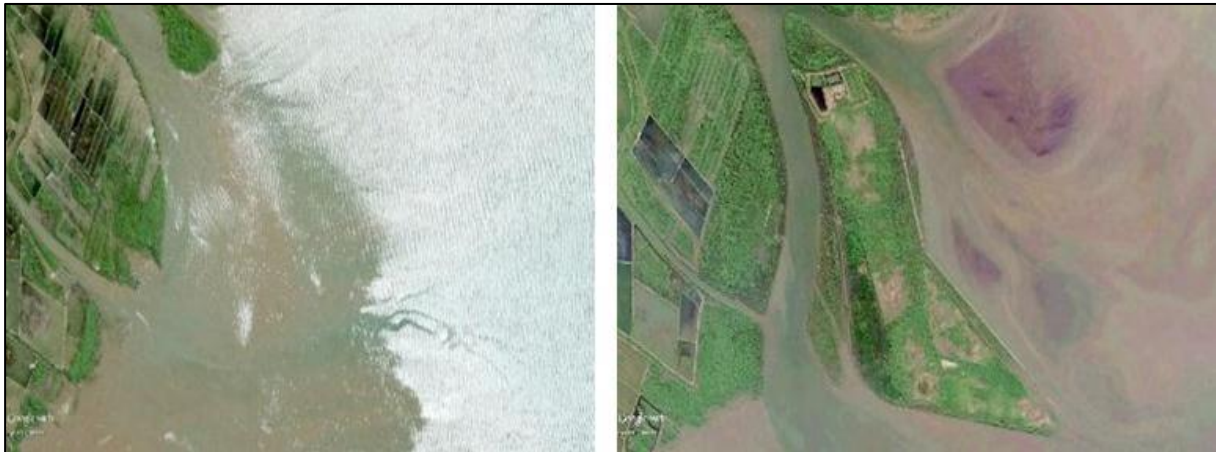
Figure 1. Porong river estuary condition in 2005 Figure 2. Porong river estuary condition in 2015

The data used include primary data and secondary data. Primary data were obtained by field measurement, direct observation and documentation; while secondary data were obtained from the literature study. Satellite data used is satellite image of Landsat in 2005 and 2015 (Figure 1 and 2).