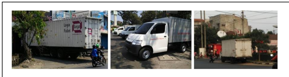
Figure 3. Fuso Engkel Wingbox Truck (a), Pick-up Boxes (b), and CDD Truck (Colt Diesel Double).