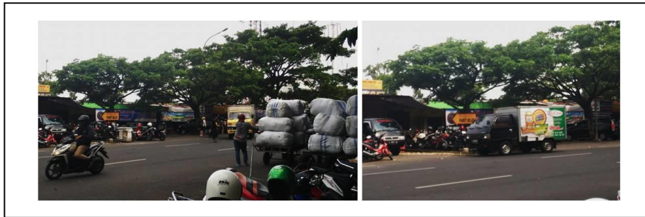
Figure 2. LSP condition in the study area.