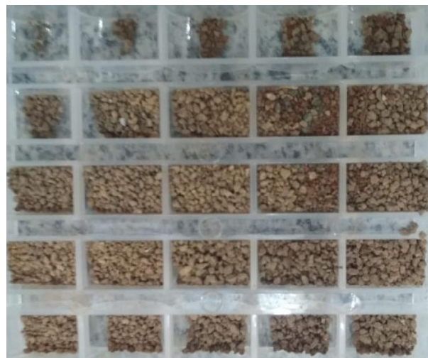
Figure 1. Photograph of soil samples captured for imagery analysis

The soil was sieved with 2 mm and 0.5 mm sieves. After oven-dried under temperature of 110° C water was added to the soil until the moisture reached 25%, 50%, 75%, and 100% of soil moisture. The soil was then analyzed in the laboratory and photographed using RGB camera (Figure 1). The photo was captured using Samsung digital camera type S5K3L8 with diaphragm opening f/2.1, ISO sensitivity 200, and exposure time 1/30s. The camera lens was positioned vertically at 25 cm above soil samples surface. The geometric resolution was 1280 x 720 pixel.