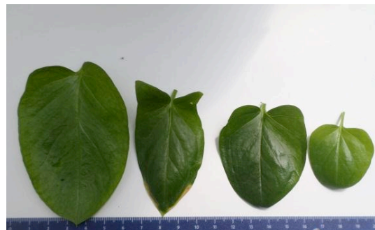
Figure 1. Leaves of Anredera cordifolia (Ten.) Steenis familiar known as binahong or gendola

Star et al. [4] reported that binahong has become a major problem in some areas where it has been naturalized due to its invasiveness. But actually, binahong grown as an ornamental species or an accessory plant, other nations consume this plant as food and vegetables that consumed freshly in salad mixture, Taiwan, and Indonesia had been used binahong as traditional medicine [5,6].