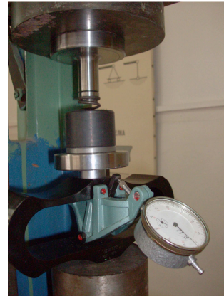
Figure 2. Device for springs contact predeformation.