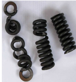
Figure 1. Defective springs of lock valves of a cargo lift B-28 (OOO KPK “Avtokranservis”, Stavropol).

The extremely important trend connected with the use of high load springs is the development of technologies of springs hardening in the process of manufacturing [3, 4]. One of the methods to harden the strings is plastic surface treatment – contact predeformation that is the additional compression of spring coils after their contact. As a result, a stripe of hardened metal (cold working) is formed along the line of coils contact. The process of hardening is accompanied by structural changes in the deformed layer and, correspondingly, by increasing its firmness and strength, the formation of favourable residual compressive stress and entirely new macro- and microgeometry of the surface of spring material [5]. The resource of compression coil springs hardened by means of such a method increases up to 40%. It is stated that the use of contact predeformation at 200-250°C makes it possible to increase the resource of springs to 60% [6]. Appliance of contact predeformation as a control operation prevents from fixing low-quality springs in work pieces. The increase of the spring resource by 15-30% makes it possible to increase reliability of machines and pieces of machinery by 15-25% [7].