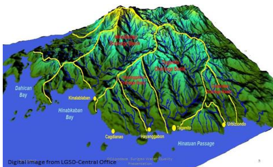
Figure 1. A digital image of the sampling area Hinadkaban Bay. This image reflects the catchment or basin covering the scope of this assessment.

This study shall contribute to the body of knowledge as to the contribution of nickel laterite mining operations to siltation load contribution along Hinadkaban Bay in Surigao, Philippines. Specifically, the individual load contributions of four identified drainage basins located in the study area namely, Hinadkaban Drainage Basin, Hayanggabon Drainage Basin, Taganito Drainage Basin and Capandan Drainage Basin, shown in figure 1, were estimated from results of water quality analysis of samples obtained specifically in sampling areas located upstream and downstream of those mine sites operating in the area [5]. Moreover, the findings of the study shall also be utilized to initiate effort leading to the development of guidelines relevant to coastal water quality criteria such as turbidity and to the design