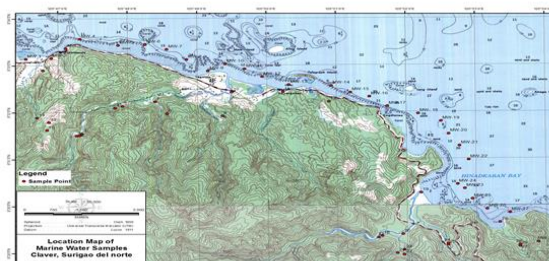
Figure 2. Site map of the Hinadkaban Bay in Surigao where coastal and river water samples were collected in March and October, 2012.

The study area was situated in Claver, Surigao del Norte and Carrascal, Surigao del Sur with approximate coordinates between 125° deg. 46" – 125 deg. 58" E and 9 deg. 26" – 9 deg. 34" N. Claver is approximately 50 kilometers from Surigao City while Carrascal, Surigao del Sur is about 70 kilometers. Access to the study area is from Butuan City through a four-hour land trip via Surigao City along the National Highway.