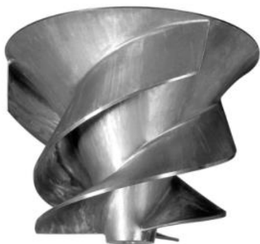
Figure 1. Schematic diagram of ARL turbine runner.

The ARL team made a new design of hydraulic turbine runner blade structure [9] and draw a spiral line shape blade (figure 1) basing on injury mechanism research of traditional turbine runner flow passage [10], which can guarantee the working efficiency of turbine (about 90%) and excellent cavitation performance at the same time, but also to ensure that the safety area of fish passing turbine. The diameter of the new runner is 1.5~2 times of the traditional turbine, so it is only suitable for the new hydropower station [11]. It is more difficult and expensive to replace the new hydraulic turbine runner with large size for the existing power station with limited size [12]. For example, a power station in the United States Columbia River Basin has carried on the economic evaluation of the ARL turbine in 2010, The results show that the turbine runner flow passage and the plant expansion cost of the ARL turbine installed 13.6 MW is about 2,340,000 $, which is higher than that of the traditional turbine installation cost of about 210,000 $ [13].