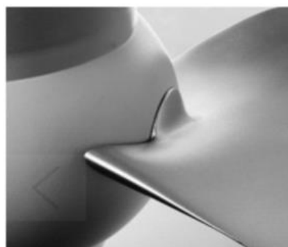
Figure 2. Schematic diagram of MCR.

The Voith team regarded optimizing the turbine flow passage structure and hydraulic conditions as the goal to optimize the structure of traditional turbine. Such as, optimization of fixed guide vanes, reducing the height of the guide vane, polishing weld, less number of blades, thicker blade inlet edge to ensure the flow passage and pressure transition smooth. The probability of mechanical damage to the fish was reduced by using the minimum clearance runner (MCR figure 2) [14]. In 2005, the MCR was used in Wanapum hydropower station in Grant County public facilities management area, Washington, and the results showed that the damage probability of fish was reduced effectively [15,16].