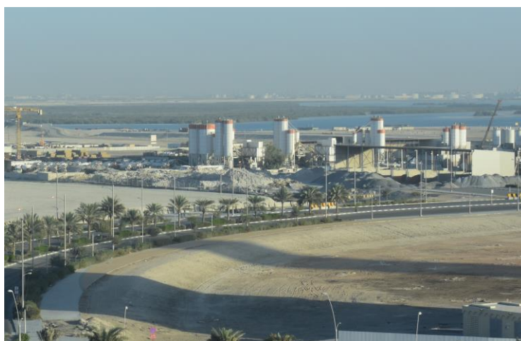
Figure 1. Cement factory inside a residential area of Abu Dhabi, UAE (photo by the authors).

In addition, chemical pollutants enter sea waters in the Gulf through atmosphere-sea water interaction and air deposition from diverse pollution sources [21,22]. This includes multiple cement factories inside the cities while construction takes place (figure 1); raw sewage discharges, especially from the Iranian side, or from not-up-to standards sewage plants, pollution from the Shatt-al-Arab River at the northwest part of the Gulf [23], and red tides [24].