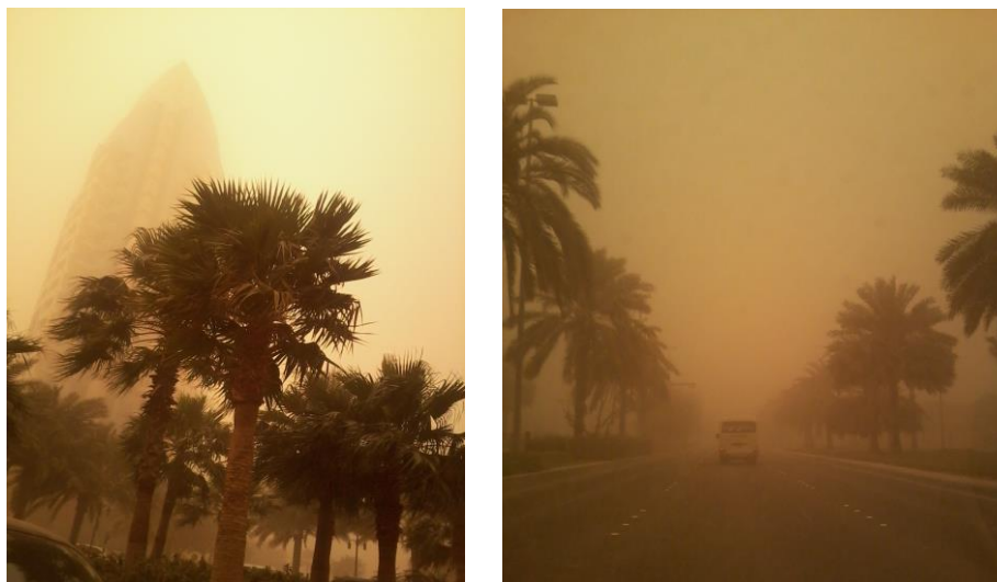
Figure 2. Dust storm, April 2015, in Abu Dhabi, UAE.

\mu\text{g}/\text{m}^3 , and all Gulf countries, with the exception of Iran and Iraq, above India that had 32 \mu\text{g}/\text{m}^3 [25]. The chart in figure 3 shows the \text{PM}_{2.5} pollution of the eight countries along the Arabian Gulf compared to China, India, Japan, USA, and several European countries, the latter all falling within the range of 12 to 19 \mu\text{g}/\text{m}^3 .