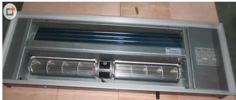
Figure 3. Basic structure of the floor convection.

The floor convection is a kind of air-conditioning terminal equipment which installs heat dissipation elements in floor grooves, as shown in Figure 3. According to the working principle, it can be divided into natural convection type and forced convection type. Being different from the fan used in common FCU, the forced floor convection adopts cross flow fan so the volume of floor convection is small, especially in the height of the body. In addition, the floor convection for summer central air conditioning system must be equipped with the condensate pipe system.