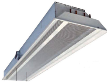
Figure 1. Basic structure of the active chilled beam.