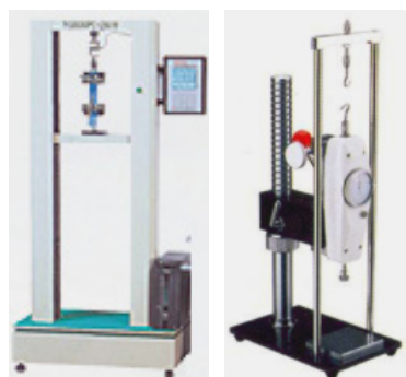
Figure 3: The testing machine for deicing force.

In winter, the fireman's outer shell might contact with the water and the water might turn into ice on the outer layer's surface. This might decrease fireman's working efficiency. To solve this problem, the coating with anti-icing performance was added onto the outer layer's outer surface. And the color of the coating was red orange, the adding weight was 20-30 gsm and the color aberration was higher than 4. Then the anti-icing force between the ice and outer layer was tested using electronic universal material testing machine or push and pull meter [6]. This force would decrease from 76.0 N/dm 2 to 22.5 N/dm 2 .