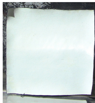
Figure 2: The inner composite PTFE membrane of outer layer.

The unlined clothing was the clothing with only one layer. The outer layer was essential, so the unlined clothing for rescue should be only one outer layer without any waterproof breathable layer or comfortable layer. This unlined clothing was light and breathable. But if there were water or rain, this clothing would be easily saturated. To deal this problem, this unlined clothing could be modified further with the waterproof and breathable performance on the outer layer by introducing other material or technique.