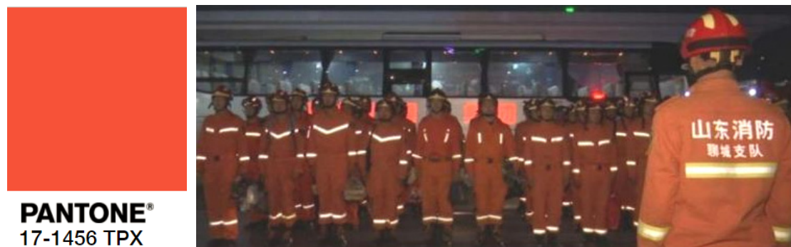
Figure 1: The pantone color and firemen with fire protective clothing for rescue.