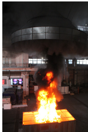
Fig. 5: Combustion experiment using 10 MW cone calorimeter.

There were four layers of standard combustible material cup boxes. Two wood bases were set below every two layers. Firstly, the ignited point was on the fourth layer in the bottom. Secondly, fire spread vertically because of the vertical gap air. Then, fire spread on the horizontal surface with the fire was growing gradually. Finally, the whole combustible material cup box commodities were in fire. During this process, the heat release rate was recorded using 10 MW cone calorimeter based on oxygen-consumption method [3] .