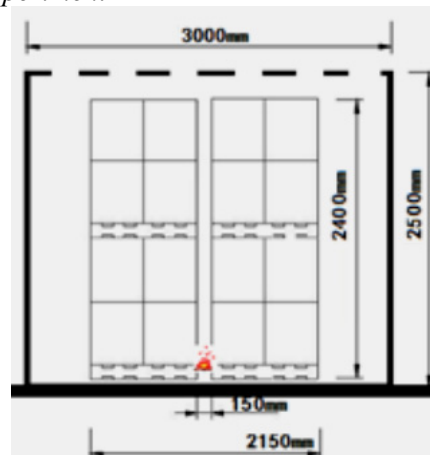
Fig. 4: The ignited point on the bottom layer.

There were four layers of standard combustible material cup boxes. Two wood bases were set below every two layers. Firstly, the ignited point was on the fourth layer in the bottom. Secondly, fire spread vertically because of the vertical gap air. Then, fire spread on the horizontal surface with the fire was growing gradually. Finally, the whole combustible material cup box commodities were in fire. During this process, the heat release rate was recorded using 10 MW cone calorimeter based on oxygen-consumption method [3] .