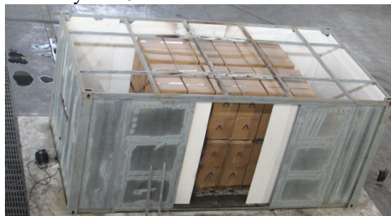
Fig.2: Freight model with standard combustible material cup box commodities.

Freight carriage's general length was 11.3-13.4 m. Then the freight carriage model was half of the real length. The surrounding walls were made of galvanized steel sheet. The supporting columns were made of angle steel. The final designed carriage model was 6*3*2.5 m. The standard combustible material plastic cup box commodity was used as freight. There were 12 commodities in this freight carriage model while one commodity had 8 standard combustible material cup boxes.