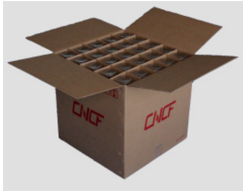
Fig.3: One standard combustible material cup box with 5*5*5 plastic cups.