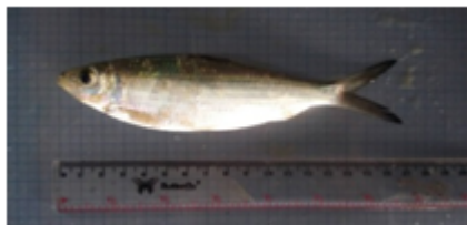
Sardinella lemuru 's