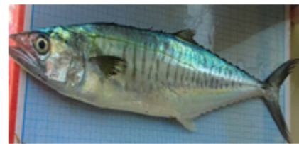
Scomberomorus plumieri 's