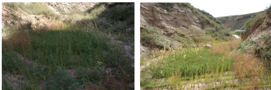
Figure 2. "Seabuckthorn Flexible Dam" in Pisha Sandstone area.