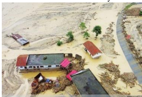
(a) Destroyed houses (Qingping Town)

Debris flow is a kind of common sudden occurred in a mountainous area of geological disasters, it is in the hydraulic condition, landform, geological condition and human condition under the joint action of a cross between collapse, landslide, collapse and other large pieces of material movement and carrying the fluid-structure interaction between the flow phenomenon of flow, solid particulate matter is a very high concentration of solid and liquid two phase mixture of nonlinear large deformation of the fluid[1]. It has extremely strong destructive, not only pose great threat to people's lives and property, but also cause serious damage to the local ecological environment. Fig.1 shows pictures of houses and roads that were destroyed in the debris flow in 2010, in Sichuan Province.