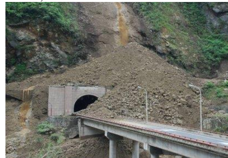
(b) Destroyed highway (Yingxiu Town)