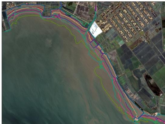
Figure 2. Extracts access to all water margin lines.