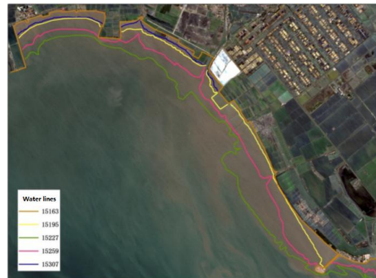
Figure 3. Painted and screened water line.

3.4.3. Waterside line high tide acquisition. In this study, we select the measured data of Nanpu tide station to calculate the corresponding tide value of each water line (Figure 1). The tidal high data of the Nanpu tide station records the tidal level of 3 to 4 moments in each day, that is, the maximum or minimum tide value of the period. According to the dynamic characteristics of the tide of the sea, the polynomial function is chosen to fit the change of daily tide level, and the tide level of the water line during the satellite transit is calculated, which is used as the water line tide value in Table 1.