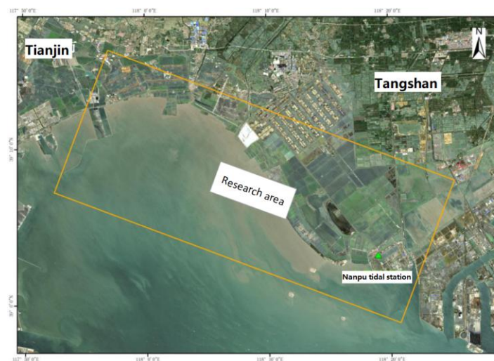
Figure 1. Sketch map(orange box) of topographic inversion test area of tidal flat.

According to the aerial geophysical remote sensing survey and application project area of Bohai coastal zone in 2016, combining with the situation of Bohai intertidal zone and the field reconnaissance, the tidal flat inversion test area chosen in this work is located in Bohai bay, which is between Tangshan South Town and Tianjin Binhai New Area Tanggu tide station, as shown in Figure 1. The tidal flat consists of silt and sandy, and the sandy tidal flat is full of various shapes of gravel and shells, covered with wormwood on its shore. Beach width (to the highest water level) is about 13m, 0-5m slope of about 10^\circ , 5-13m slope of about 15^\circ . The length, width and slope of the selected tidal flat are more suitable as a topographic inversion test area for tidal flats.