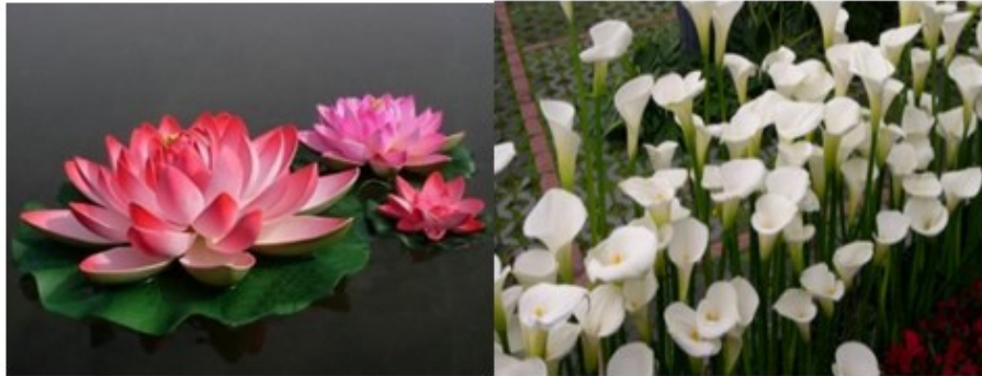
Figure 2. Lotus (( Nymphaea ), Kala lili ( Zantedeschia Aethiopica )

( Nymphaea ), Tifa ( Typha latifolia ), water hyacinth ( Eichornia crassipes ), Lotus ( Nymphaea lotus ), Seroja ( Nelumbo nucifera ), Apu-apu ( Pistia stratiotes , Pistia crispata ) dan Kala lili ( Zantedeschia aethiopica ). Sample of water plants can see in figure 2.