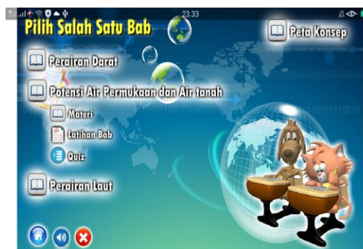
Figure 4. Sub-Section of Materials

In Figure 4 shows that the sub-section of materials consists of four chapters which are the concept maps, the terrestrial waters, the potential of surface water and groundwater, and marine waters. Each material in the chapter is equipped with Exercise, quizzes and group discussions.