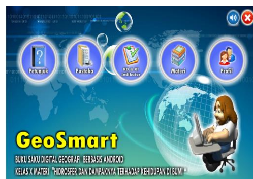
Figure 3. The Menu of Geo-smart based-android