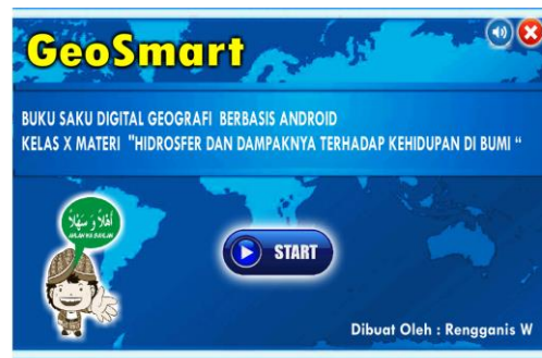
Figure 2. The Display of Geo-smart based android