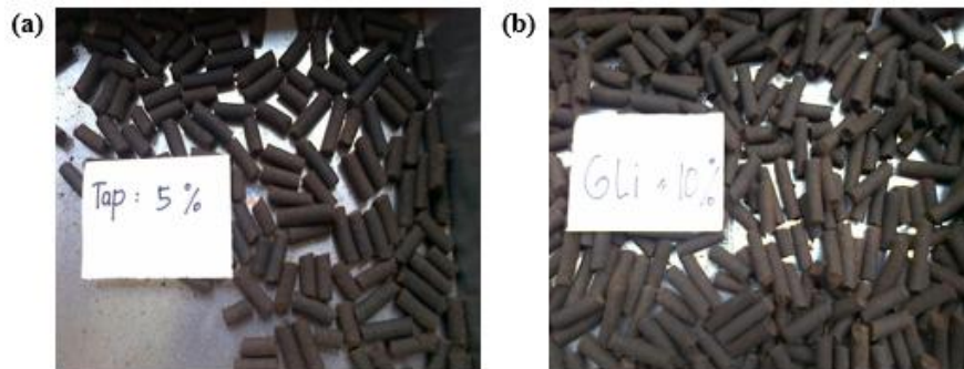
Figure 3. Long size and stable formation of Acacia bark waste fuel pellet in the presence of tapioca and glycerol as binder and additive; (a) 5% tapioca and (b) in the presence of 10% glycerol