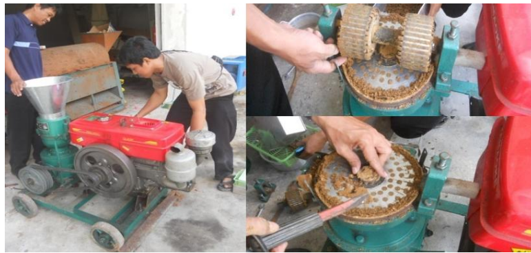
Figure 2. Modified animal feed pellet press machine equipped with rotating roller-cylinders used on trial production of fuel pellet from A. mangium bark waste biomass