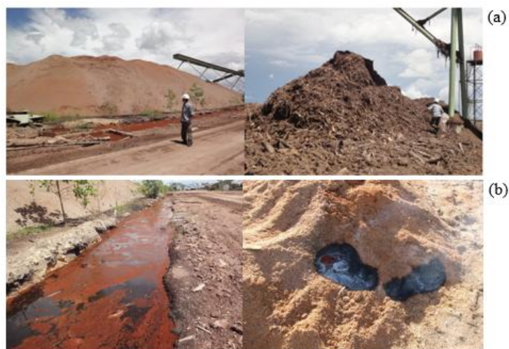
Figure1. (a) Abundant Acacia wood bark and sawdust waste biomass produced daily in chip mill industry; (b) contamination of groundwater sources and vulnerable fire around industrial sites

Herein this study, we found the low technology developed from a modified common animal feed pellet press machine equipped with rotating roller-cylinders was effective to be used to made fuel pellet from Acacia bark waste biomass, even other additive materials such as tapioca and glycerol required to be blended to form the highest quality of fuel pellet (Figure 2.). Additives play a major role in wood pellet characteristics and are a subject of major interest as they act as binding agents for the biomass raw material[8]. We found in the less tapioca used, they were easily broken into the small pieces form during pelletizing or producing a low physical quality of fuel pellet. This fact was similar with the situation that reported on empty fruit bunches used as feedstock for the pellet production [9,10]. Tapioca was used to bind the small surface of bark dust material. This natural binder was applied to increase physical properties of feedstock such as low density and less surface area that hinder the smooth flow ability of biomass and also to substitute natural function of lignin as binder. Lignin as natural binder on briquette and pellet production was common used and reported previously [11].