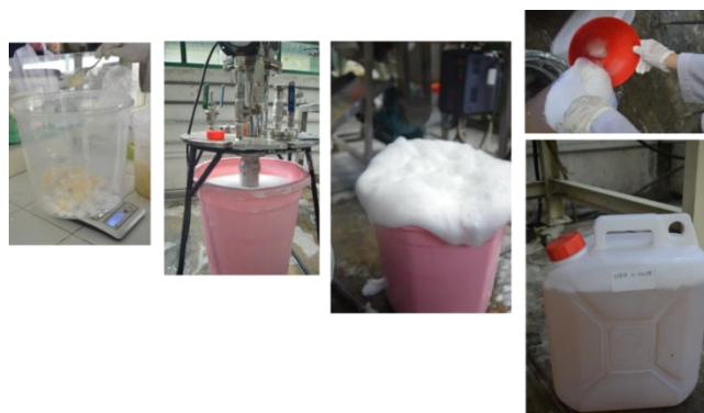
Figure 1. Formulation and homogenation process of foaming agent concentrate at 25 liter scale