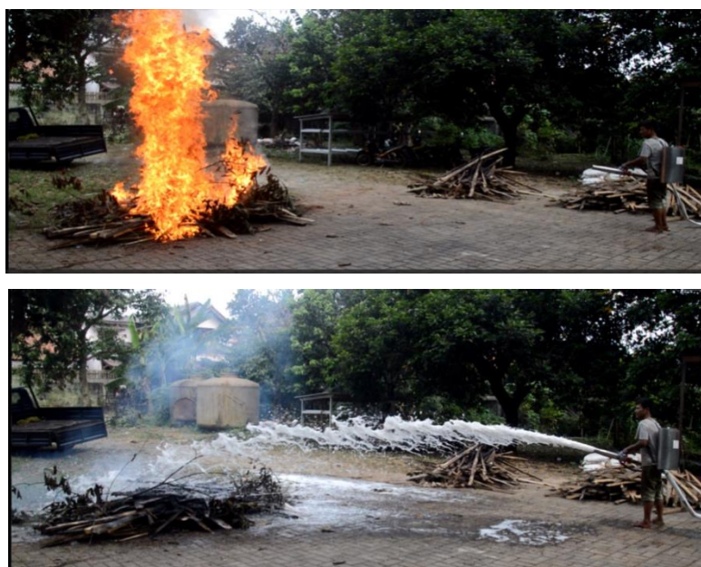
Figure 4. Fire extinguishment trial by using resulted formulas of foaming agent concentrates