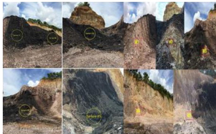
Figure 3: Locations of B1-B5 and W1-W5 samples located at Outcrop 7.