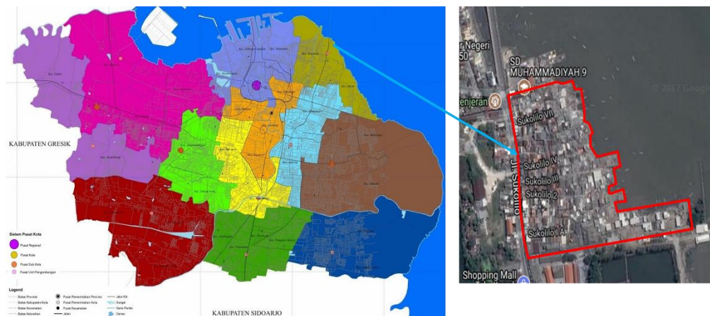
Figure 1. Coastal area of Sukolilo, Bulak District, Surabaya.

Realities of poverty, vulnerability, and environment degradation require comprehensive concept in overcoming the coastal area condition of Surabaya. The concept that needs to be developed should accommodate the needs of the coastal society in every aspect of their life and support welfare improvement and sustainable livelihood.