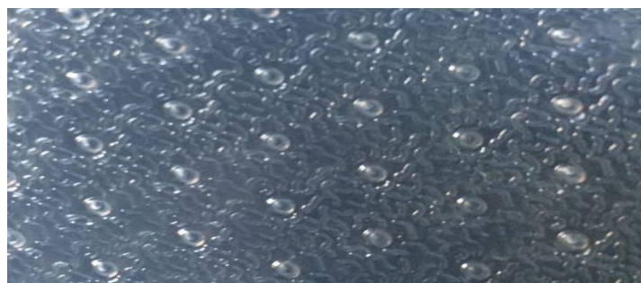
Figure 2. UV plastic with 14% reducing sunlight intensity.