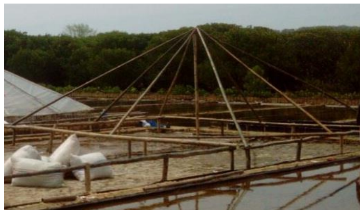
Figure 1. Bamboo framework of a low-cost greenhouse.