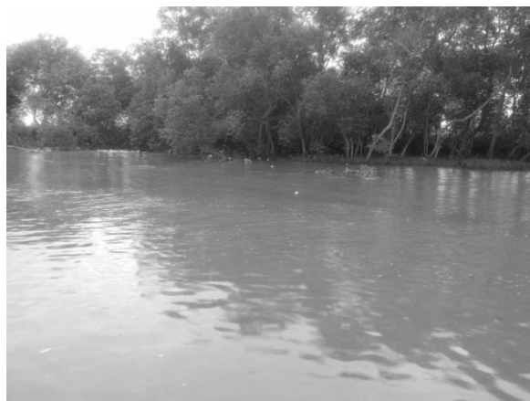
Figure 2. Location of sample waters.

The research data stated that the extreme waters at the locations of Wonokromo, Dadapan and Juanda was caused by the condition of water brightness. The brightness at 3 stations were 60 cm at Wonokromo, 40 cm at Dadapan and 100 cm at Juanda waters. Ammonia at the three stations were measured at 0.837 mg/L in the waters of Wonokromo, 0.626 mg/L in Dadapan and 0.396 mg/L in Juanda.