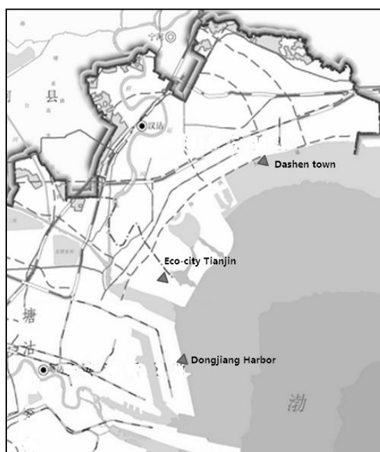
Fig.1 Sampling points

In mid-October 2014, we selected three locations for soil sampling in Tianjin Binhai New Area: Eco-city Tianjin, Dongjiang Harbor and DASHEN town beach. In each sample plot, samples were taken with 1.2 meters high and 0.1 meters in diameters, using special soil survey dedicated sampler. In Dongjiang Harbor Coast and DASHEN town beach, samples were taken from the sediments submerged in water level below high tide line. Set the sampling points in the high, middle, and low tide bits of each sampling point. Each sample was taken in triplicate. The interval between the sampling points was about 15m. In the Eco-city Tianjin sampling points around the sea due to the region has been part of the artificial with no tide, set two sampling points spaced 20 meters, each site sampling for three time. At all, 24 soil profiles were taken. Sampling depth to bedrock, the shallowest of about 45cm, and the deepest of about 60cm. Each sub-soil profile three levels: upper, middle, lower, and then the seal number bagged soil samples, and be send to the laboratory for processing.