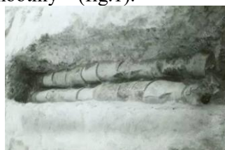
Figure 1. drainage pipeline

With the birth of cities in China, urban drainage was paid attention to, and the corresponding facilities were built. As early as 4000 years ago, one ceramic drainage pipeline had appeared in Henan Huaiyang Pingliangtai Longshan culture site. Located under the south gateway with a depth of 0.3m, the pipeline is over 6 meters long, and consists of three earthenware pipes, two of which are on the top, one on the bottom. Per pipe is 0.35~0.45m long, and one end with a diameter of 0.27~0.32m is thicker than the other end with a diameter of 0.23~0.26m. Each thinner end faces south, inserting in a thicker mouth of another pipe. From the whole pipeline, the north part is slightly higher than the south one in order to be suitable to drain smoothly [1] (fig.1).