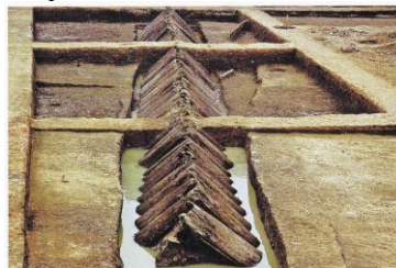
Figure 6. drainage facilities

vertical and the bottom is smooth. At the bottom of the ditch 58 wooden floor plates are paved, and its west end is 0.3m higher than east end, forming a slight slope. The floor plate is rectangle with a length of 2.5m, a width of 0.65m, and a depth of 0.15m. Along the both side of the plate, two deep grooves were chiseled with a width of 0.5m, a depth of 0.03m. Some tilted plates were erected in turn on the grooves. The tilted plates are made of 1/3 of the log, usually 1.6m in length, 0.66 in width, 0.2m in depth (fig.6). On the east side of the triangular drainage facilities are wooden trench buildings consisting of two wooden grooves from north to south, named No.1 and No.2 in turn. Their construction method is to dig a trench with a depth of 0.65m and a width of 2.1m on the ground at first, and then erect wooden blocks and vertical symmetrical stakes on both sides of the east and west of the trench, with some vertical symmetrical stakes on both sides of the blocks. Among them, in the No.1 groove are mainly round stakes, in the No.2 mainly square stakes. Between the lower ends of two stakes, sometimes a strip of wood with square or rhombic mortises is paved in order to sustain.