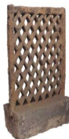
Figure 5. iron window

At the same time, the drainage culvert has also been found in the West Garden of Daming Palace. It was made of bricks and stone, and in order to prevent blockages, two iron windows have been installed. The first is mullioned window consisting of iron bars for blocking larger garbage. The second consists of iron bars which form many rhombus holes for blocking smaller garbage to ensure the smooth drainage (fig.5).