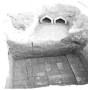
Figure 3. sedimentation tank