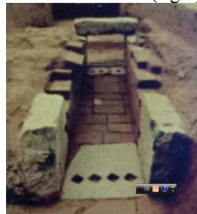
Figure 4. water culvert

In 2009, to the south of Daming palace Xuanwu gate of Tang dynasty Changan city, one water culvert relic has been found. The culvert was made of bricks and stone, with one length of 2.86m from east to west, one width of 1.06m from south to north, one height of 0.7m, and one internal width of 0.62m. The bottom and sides of the culvert were built with slates, in which the bottom stones were evenly chiseled with four rhombus holes. Nowadays, there is one surviving stone cover at the top of the culvert, and there are four rhombus holes at the bottom surface, just corresponding to the hole of the bottom stone. Accordingly, there should have been a stone cover on the top of the east side. In addition, 4 rows of side bricks were arranged from north to south outside the west end, and slope from west to east. So water flowed from the west to the east [5] (fig.4).