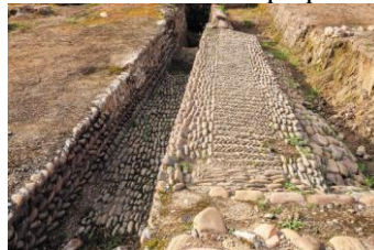
Figure 7. drainage ditch

About Ming Dynasty City, We can take Liaosi old city of Hunan province as the representative of all. At the palace area retains the stairs, walls, wall, apron, drainage and other architectural ruins. In the center of the road, the smallest pebble was arranged in the shape of herringbone pattern, and some large pebbles were paved at both sides of the road for slope protection and drainage ditch [6] (fig.7).